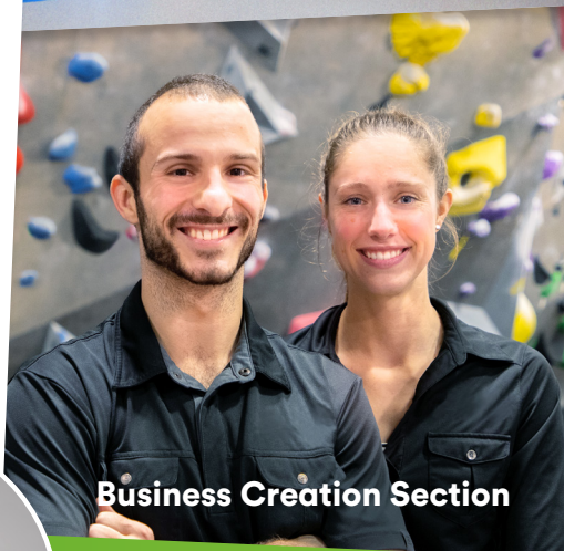
Business Creation Section