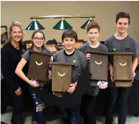
S.O.S. Chauves-souris Helping out the bat population Mauricie – Secondary Cycle One

As part of the Semaine des entrepreneurs à l'école, an entrepreneur visited your school to share their journey. Did you know that other students your age have developed projects at their schools? Here are a few: