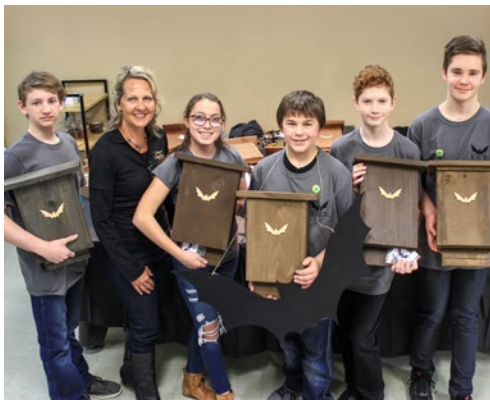
S.O.S. Chauves-souris Helping out the bat population! Mauricie – Secondary Cycle One