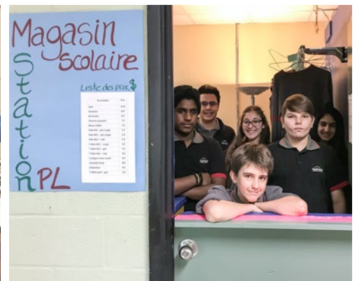
Magasin scolaire – Station PL School store for responsible consumption Montréal – Secondary Cycle Two