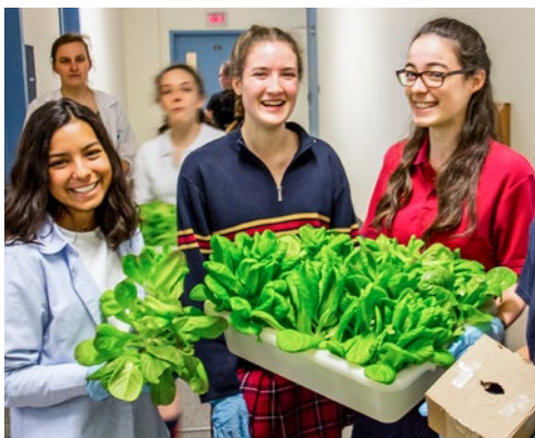
Serre-toi Environmental hydroponic greenhouse project Capitale-Nationale – Secondary Cycle Two