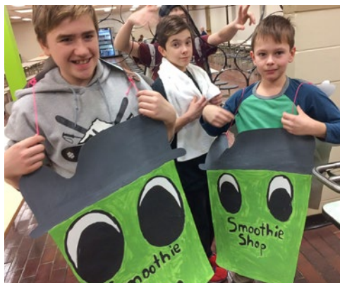
Smoothie Shop Making delicious smoothies Bas-Saint-Laurent – Secondary Cycle Two