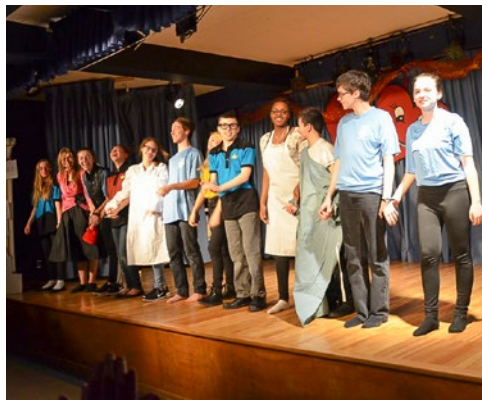
An evening full of theatre, poetry and... chocolate Theatrical sketches, poetry and music Estrie – Secondary Cycle One